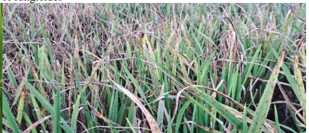
Brown spot damage symptoms