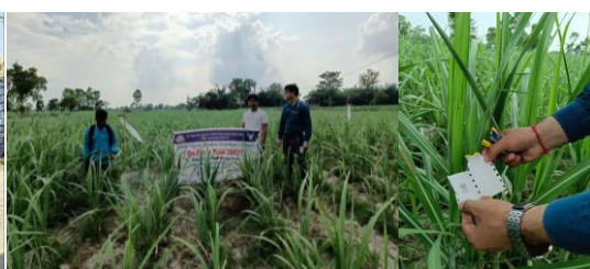
Spray of insecticide