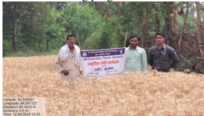
Demonstration at farmer's field