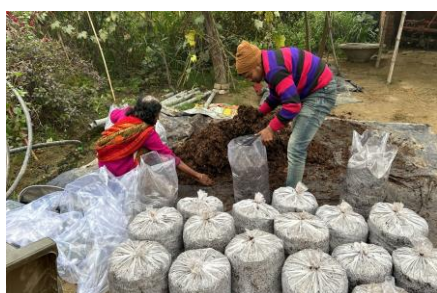
Oyster Mushroom Cultivation

Conclusion: The results demonstrated that technology option 2 (TO 2 ) showcased superior outcomes. It achieved higher rehydration ratios of 3.73, 3.68, 3.55, and 3.50 for initial, 30 days, 60 days, and 90 days, respectively as well as better colour and overall acceptability compared to technology option 1 (TO 1 ). Although no significant difference was observed between TO 1 and TO 2 in rehydration ratio, yet statistically differences in terms of color and overall acceptability when compared not only to farmer practices but also to each other. Among the options, TO 2 emerged as the preferred choice in terms of overall acceptability.