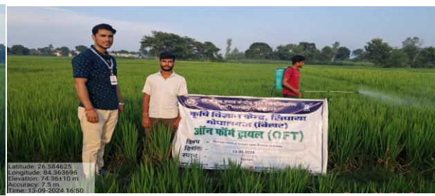
Application of fungicides