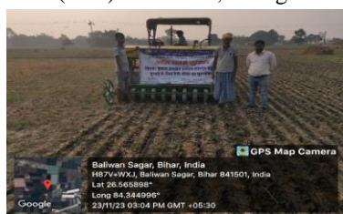
Wheat sown by Zero till drill

Conclusion: Significant difference ( P < 0.05 ) in no. of grains, grains weight and wheat yield were observed for technology options over farmer practices. TO 1 was best in terms of yield (37.76 q/ha) and benefit-cost ratio (2.72). However, no significant difference was observed among TO 1 and TO 2 .