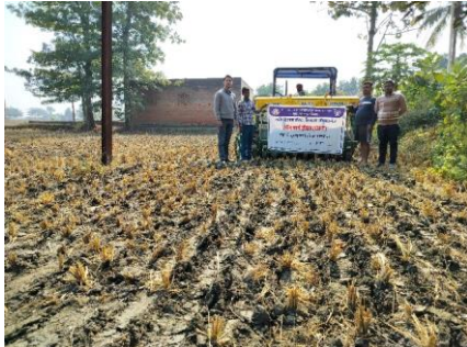
Wheat sowing through Happy seeder

Conclusion: Significant difference in plant population and wheat yield were observed for technology options over farmer practices. TO 1 was best in terms of benefit-cost ratio (2.99). However, no significant difference was observed yield among between TO 1 and TO 2 .