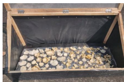
Low cost solar dryer