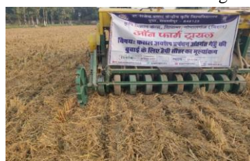
Sowing of wheat by Happy seeder incorporating the crop residue