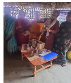
Demonstration of milk adulteration kit