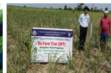
Installation of pheromone traps