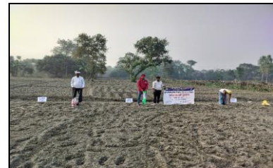
Manual Rotary Dibbler