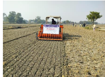
Wheat sowing through Super Seeder