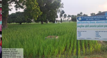
Demonstration at KVK