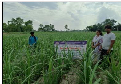
Spray of GA3