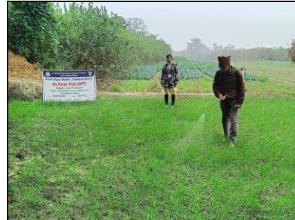
Spray of Nano DAP